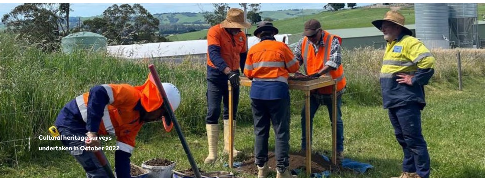
Cultural heritage surveys undertaken in October 2022

For more information on how First Peoples cultural heritage will be managed by the project, view Chapter 4: Underwater Cultural Heritage in Volume 3 and Chapter 13: Aboriginal Cultural Heritage in Volume 4 of the Environmental Impact Statement/ Environment Effect Statement (EIS/ EES) via Marinus Link's website at marinuslink.com.au/assessment/eis-ees .